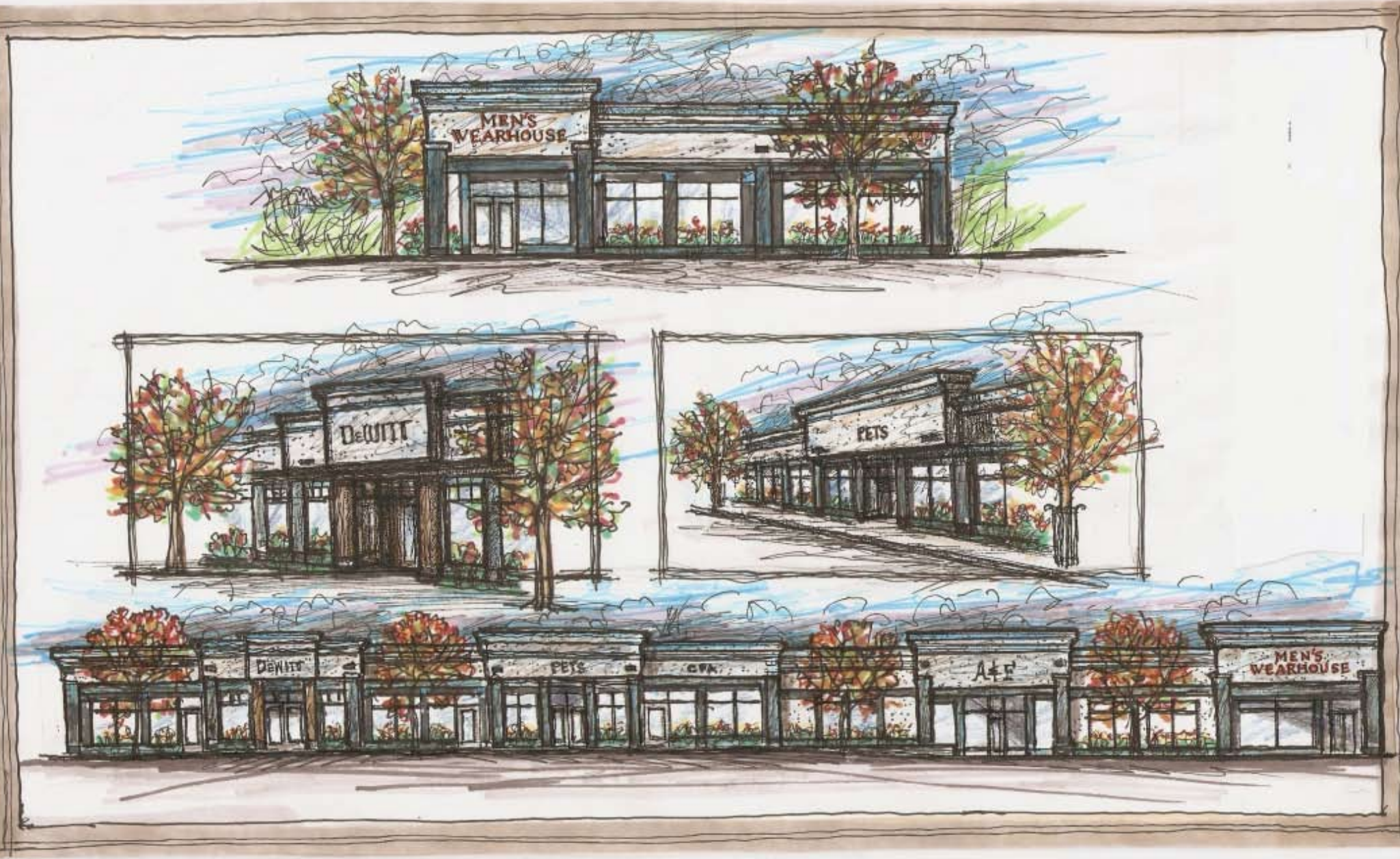
3470 Erie Boulevard, East Dewitt, NY